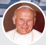
St John Paul II