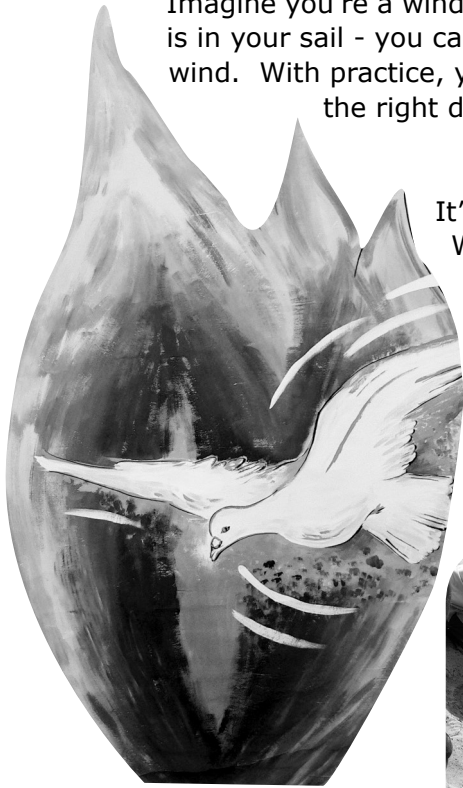
'Dove & Flame' Linda Gregor.

Imagine you're a windsurfer skimming through the water. You know the wind is in your sail - you cannot see the wind - you can only feel the effects of the wind. With practice, you learn to use the wind to steer the windsurfer in the right direction.