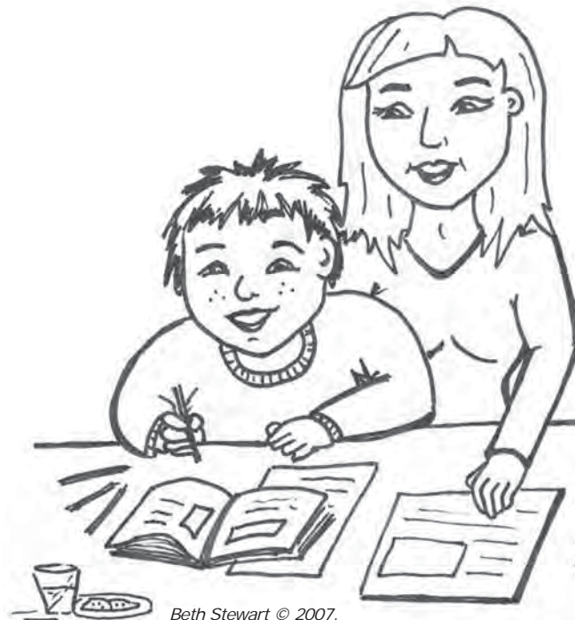
Beth Stewart © 2007.

Students are encouraged to explore a variety of options which allow them to be actively involved in the season of Advent.